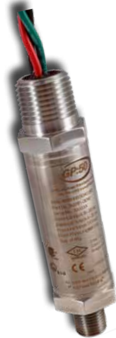
STANDARD WIRING CONFIGURATION