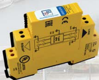
Model BCP3000* Surge Protector for Model 311-M351 Birdcage®