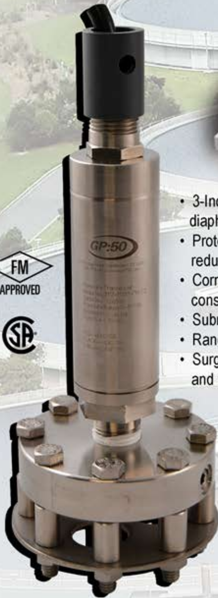
Model 311-M351* Birdcage® Submersible Pump Lift Station