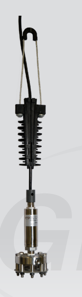
Model BCH2000 Cable Hanger